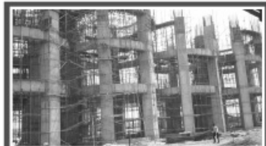
Coal Silo under construction at Meramandali, Orissa

Company's philosophy on corporate governance is guided by a strong emphasis on transparency, accountability and integrity which is being practiced over the years. All employees are bound by a code of conduct which sets forth Company's policies on all important issues including its relationship with customers and Government Agencies. This message has been drilled down to all levels of employees. Since a right mixture of what Company expects from the employees and what employees desire from the Company is constantly formulated through interactive and participative relationship between Management and Employees, a sense of belongingness amongst its employees is being developed progressively. Training is an integral part of Company's business strategy. During the period, execution of identified training needs was made with emphasis on improving competencies towards collaborative and sustainable approach to strategic business planning commensurate with recent trends in domestic as well as international business scenario. Such planning reflected the organizational needs being currently addressed in the form of improving Enterprise Resource Planning system and bringing further diversification in Company's product range.