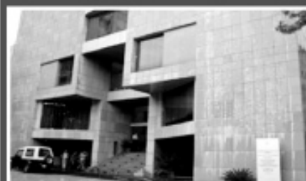
ICCR Cultural Complex and Regional Centre for Ministry of External Affairs, New Delhi at Kolkata