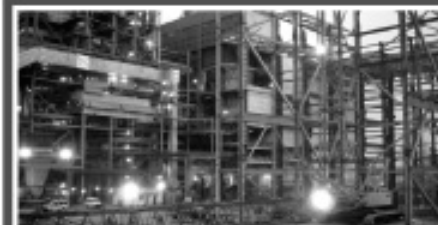
Power House Building for 210 MW Bakreswar Thermal Power Station