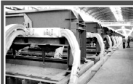
POT assembly for Smelter Project at NALCO, Angul, Orissa

Capital : Rs. NIL Revenue : Rs. 6,78,245/-