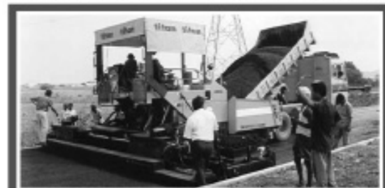
Road Project under progress at Vijayawada

The Company has been continuously pursuing to update technology and upgrade quality standards alongwith R&D efforts. It has already established successful operations in many diversified areas such as Cross Country Pipeline, Mechanized Construction of Highways and Expressways, Metro Rail at Delhi, Furnace and Heaters, Main Boiler Work in Thermal Power Station, Storage Silos for Alumina, Bailey Bridge, Railway Wagons, Water Supply and Sewerage Systems, LSTK Projects.